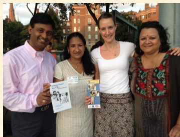
CITE: TB Education Initiative at the India Day Health Fair