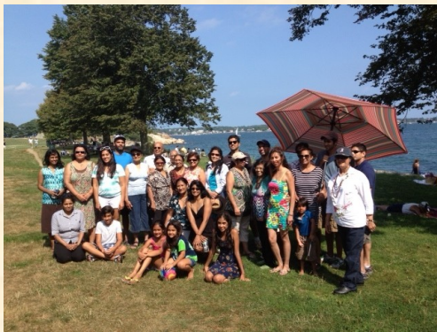
Summer Picnic, Gloucester, MA