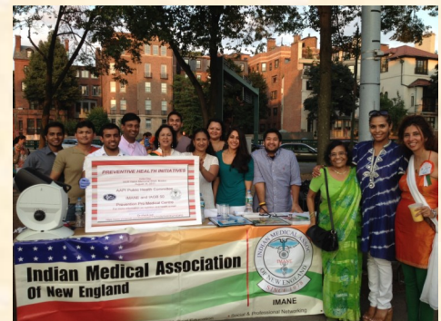
IAGB-India Day Health Fair Volunteers